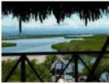
ANABOCA Marine Turtles observation